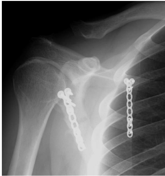
Post-surgical X-ray of same patient injury shown earlier in 3-D scans.

displaced (not in appropriate alignment) require surgery to restore and maintain the fractures in good position. Surgery usually includes repositioning the fracture fragments and holding the position with sutures, wires, plates, or screws. After immobilization (with or without surgery), stretching and strengthening of the injured and weakened joints (elbow and shoulder) and surrounding muscles (due to the injury and the immobilization) are necessary. This is usually done with the assistance of a physical therapist or athletic trainer.