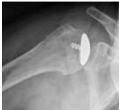
Postoperative X-ray of a minimally invasive humeral head (shoulder ball) resurfacing