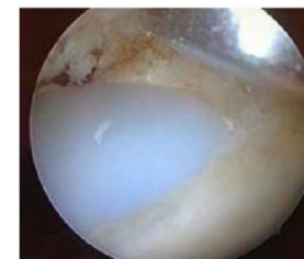
Arthroscopic photos of replacing the glenoid (shoulder socket) surface

STEVEN CHUDIK MD SHOULDER, KNEE & SPORTS MEDICINE