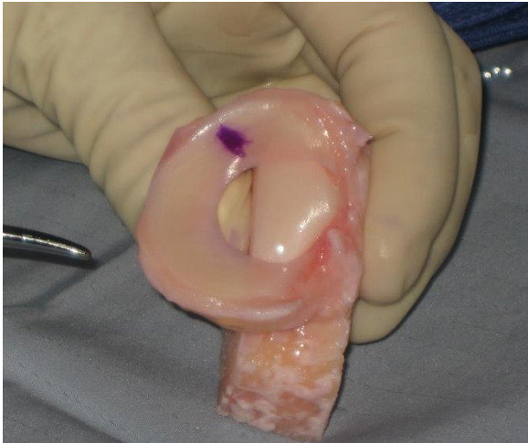
A meniscus allograft