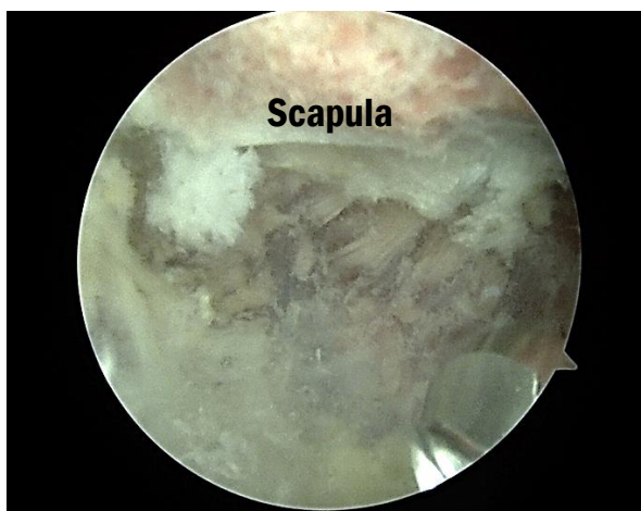
Partial arthroscopic scapulectomy to remove bony prominence