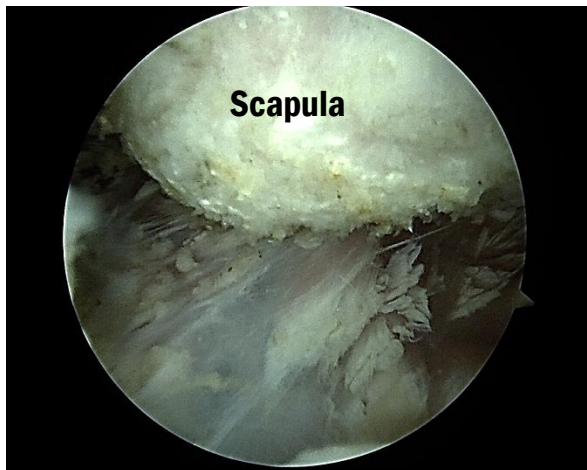
Prominent bony edge of the scapula

Initial treatment consists of stretching/strengthening exercises and avoidance of the activity that initially caused the problem. Referral to a physical therapist or athletic trainer for treatment is often necessary. An injection of cortisone into the inflamed scapular bursa may be recommended. Surgery to remove the bursa or bony prominence or soft tissue mass may be recommended, but this is usually only considered after failure of conservative treatment.