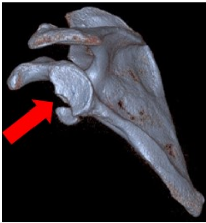
3-D CT scan of a bony Bankart (shoulder socket) fracture