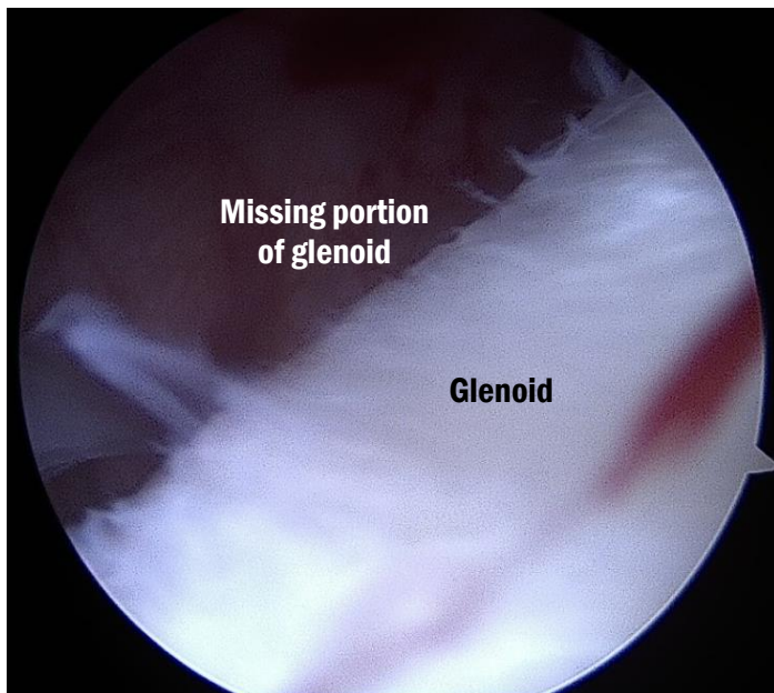
Arthroscopic view of bone deficient glenoid