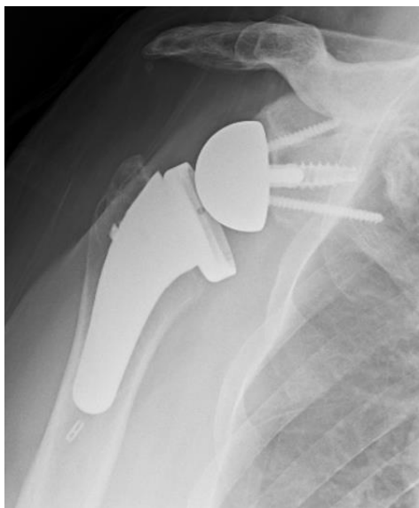
X-ray following Reverse Total Shoulder Arthroplasty (replacement)