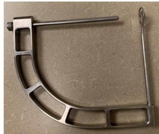
Dr. Chudik patented shoulder joint surface repair guide