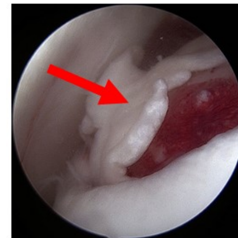
Arthroscopic picture of a shoulder osteochondritis dissecans (OCD) lesion

STEVEN CHUDIK MD SHOULDER, KNEE & SPORTS MEDICINE