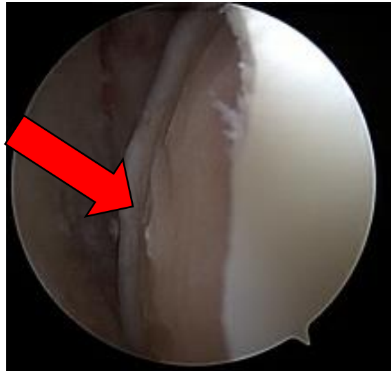
Arthroscopic images of healthy cartilage (left) and cartilage damage after debridement (right).