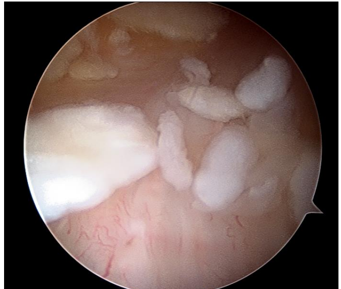
Arthroscopic view of loose bodies of cartilage from an injury site