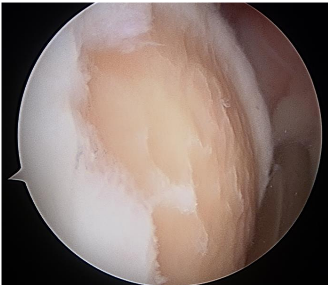
Arthroscopic view of cartilage damage of humeral head

Smaller, isolated cartilage tears may not cause significant symptoms and the patient may be able to continue without surgical intervention. Larger, more complex tears are likely to cause continued pain and other symptoms, and typically are addressed surgically. In addition, injuries of this nature are more likely to progress and lead to arthritis (widespread loss of cartilage surface). Timely, appropriate treatment can help reduce symptoms and return the patient to moderate activity levels.