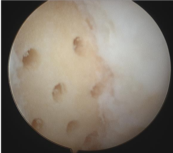
Arthroscopic view of drilling to stimulate reparative tissue growth