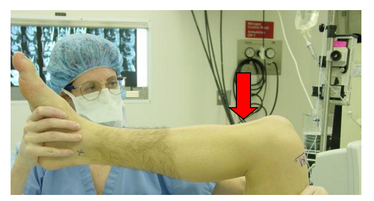
PCL tear (tibia sags posteriorly)