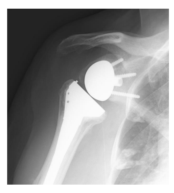
Post-operative X-ray of reverse total shoulder arthroplasty