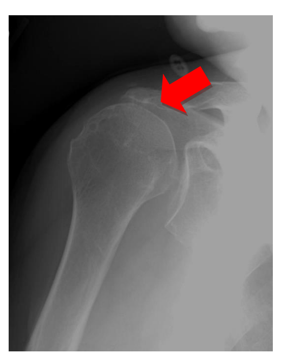
X-Ray showing upward migration of humerus in shoulder joint, common in patients with rotator cuff arthropathy

There are many theories as to why this condition occurs for some patients and not others. Regardless, the pathology of arthritis and massive rotator cuff tear lead to weakness, pain, and inflammation, which cause decreased mobility and continued symptoms.