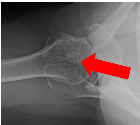
X-ray of os acromiale looking from the top of the shoulder.

The acromion (bony roof) of the shoulder develops from different growth centers made of cartilage. During development, these growth centers grow, transform into bone, and fuse together to form one bone. Occasionally, one or more of these growth centers does not completely fuse with others. The end of the acromion which does not fuse, separated by a layer of cartilage and fibrous tissue from the remainder of the bony acromion and scapula, is called an os acromiale. The os acromiale, the unfused portion of the bony acromion, is typically asymptomatic (non-painful) and does not require treatment. However, when the os acromiale, is unstable and mobile, which can occur after a traumatic injury, it may pinch the rotator cuff tendon or bursa, causing symptoms of rotator cuff inflammation and pain. When severe enough, these symptoms warrant surgical intervention.