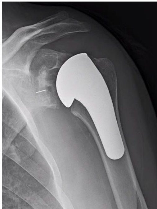
Total shoulder arthroplasty (replacement)

Dr. Chudik makes a limited incision over the front of the shoulder and works through intervals in the shoulder and chest muscles so he can resurface the humerus (ball) and the glenoid (socket). These worn surfaces are replaced with metal and special plastic components that are fit to your shoulder.