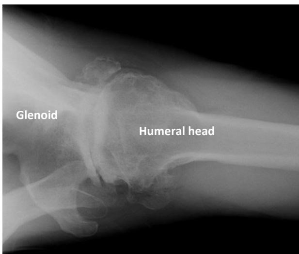
X-rays of glenohumeral (shoulder) arthritis. Note the lack of joint space between the bones