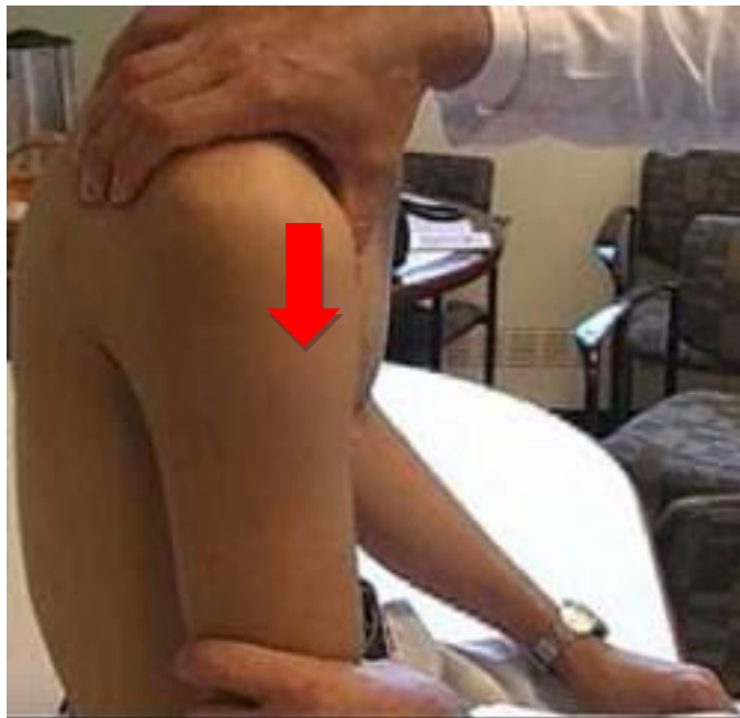
Shoulder exam for instability

Surgery for multidirectional instability (MDI) is reserved for people with loose shoulders who experience shoulder instability during activities of daily living or sports activities and have failed conservative treatment. Patients with generalized ligamentous laxity and loose shoulders can be susceptible to MDI. Repetitive overhead activities (throwing, swimming, gymnastics, etc.) may possibly stretch these loose capsules out further creating a situation of impaired joint position sense resulting in recurrent and uncontrolled shoulder instability (slipping out of place). The goal of surgery is to re-tension these loose capsules, improve proper joint position sense, and restore shoulder stability.