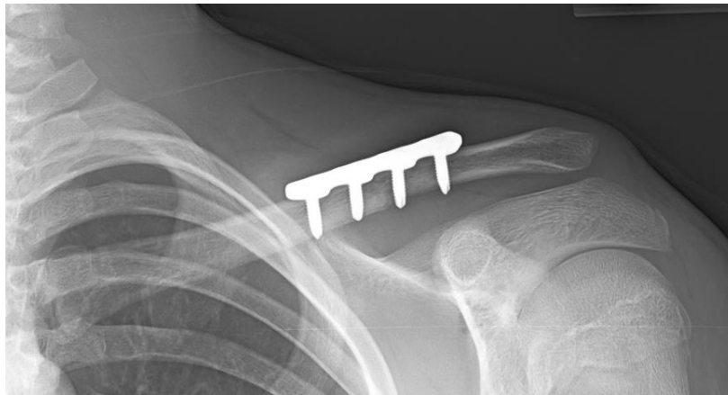
Plate fixation of a midshaft clavicle fracture

Surgery consists of making a small open incision over the clavicle, repositioning the fracture fragments, and holding them in place with plates, screws, wires, sutures, or pins. After fracture healing, these fixation devices may be removed if needed. During surgery, X-ray is used to ensure that all fragments are appropriately aligned.