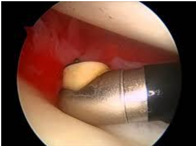
Arthroscopically releasing the inflamed joint capsule