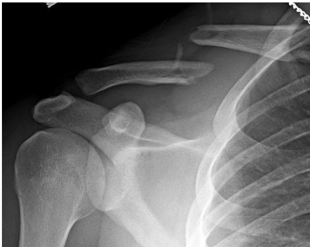
X-ray of a clavicle fracture

Most mid-shaft clavicle fractures heal on their own without complications over six to 12 weeks. Children typically heal faster than adults. Fractures with significant displacement larger than 2 cm have a higher risk for not healing or healing with deformity that may result in shoulder limitations. Significantly displaced and open (when the bone breaks through the skin) fractures require surgery to restore the proper bony alignment of the clavicle and promote healing. Patient lifestyle factors, such as smoking, can prevent normal healing.