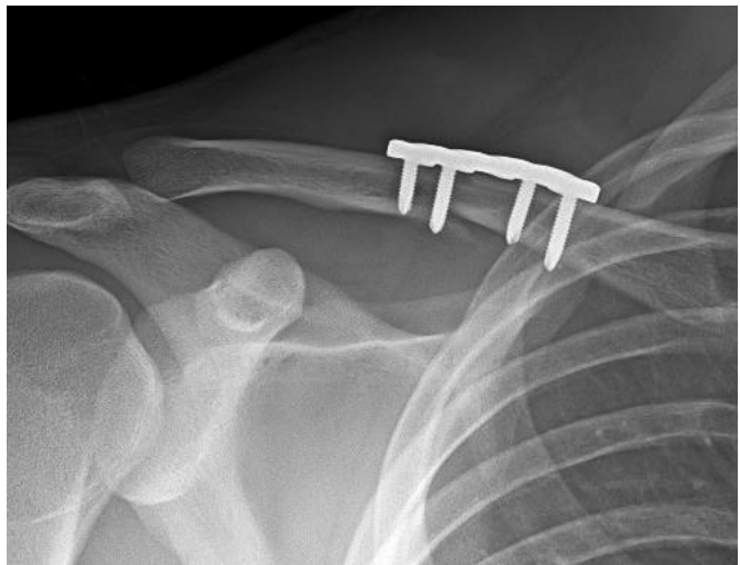
Post-operative X-ray of a repaired clavicle fracture